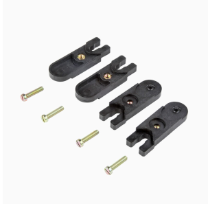
External attachment lugs 4-part set