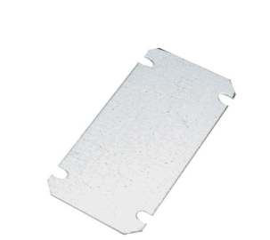
Mounting plates, 1.5 mm sheet steel, galvanised