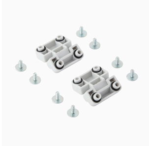
MPC series, hinges, set of 2