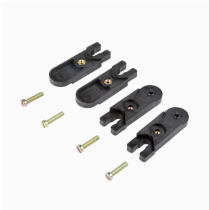
External attachment lugs 4-part set