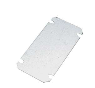
Mounting plates, 1.5 mm sheet steel, galvanised