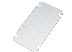
Mounting plates, 1.5 mm sheet steel, galvanised