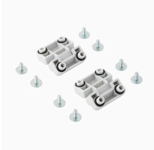
MPC series, hinges, set of 2