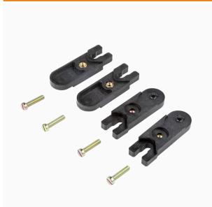
External attachment lugs 4-part set