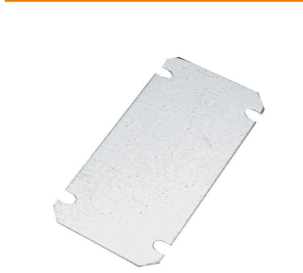
Mounting plates, 1.5 mm sheet steel, galvanised