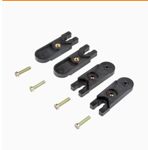
External attachment lugs 4-part set