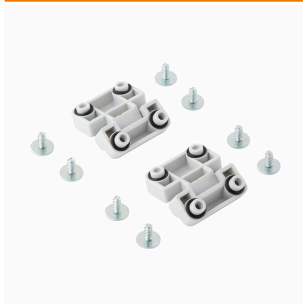
MPC series, hinges, set of 2