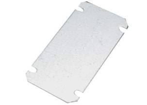
Mounting plates, 1.5 mm sheet steel, galvanised