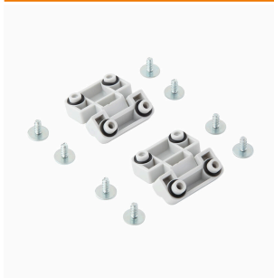
MPC series, hinges, set of 2