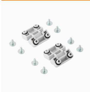
MPC series, hinges, set of 2