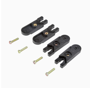
External attachment lugs 4-part set