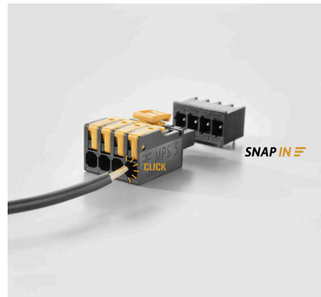
Fastest connection technology SNAP IN