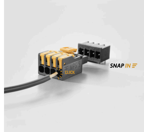
Fastest connection technology SNAP IN