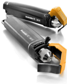
Sheathing stripper for PVC cables