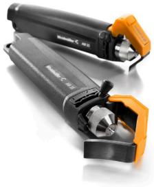
Sheathing stripper for PVC cables