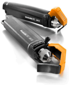
Sheathing stripper for PVC cables