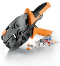
Crimping tools for wire end ferrules, with and without plastic collars