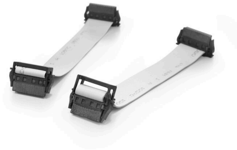
With optional strain relief