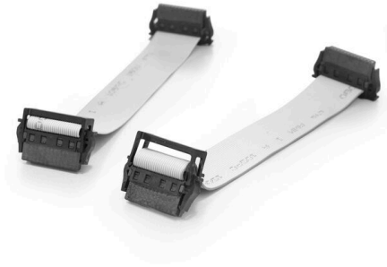
With optional strain relief