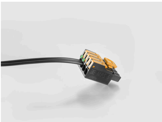
Acoustic and visual feedback