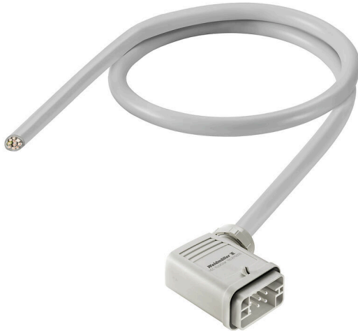
Product similar to illustration