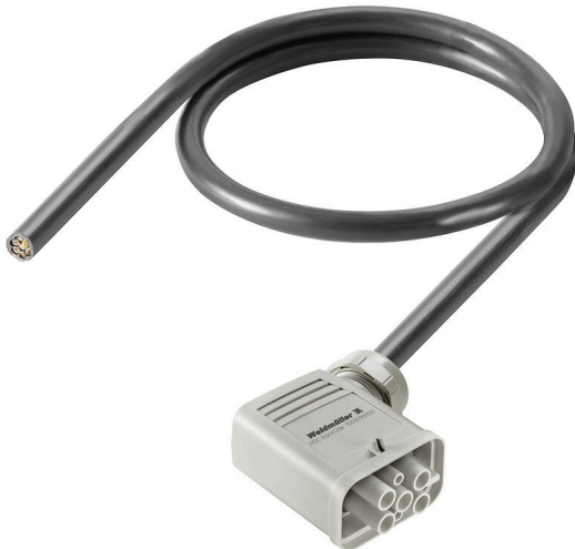
Product similar to illustration