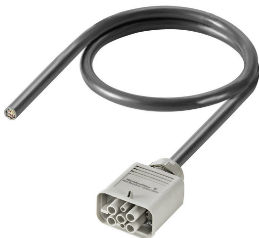
Product similar to illustration