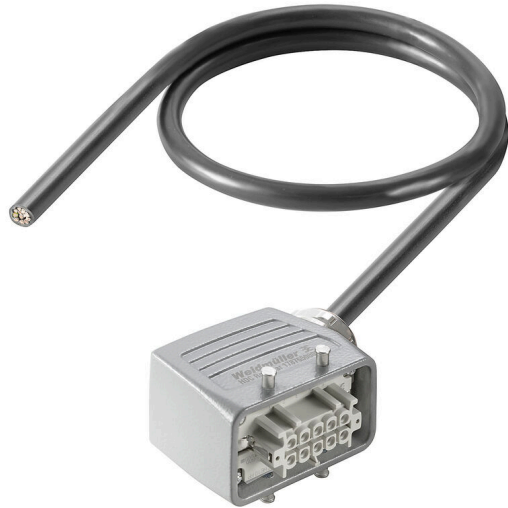
Product similar to illustration