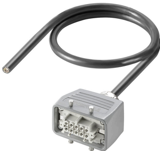
Product similar to illustration