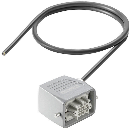
Product similar to the picture