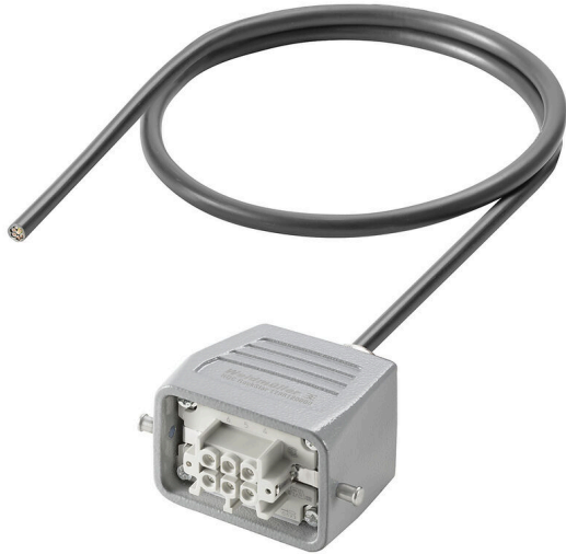
Product similar to the picture