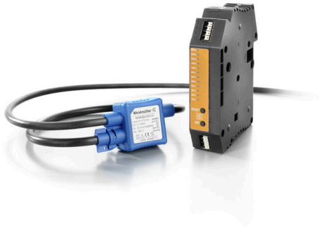
use with Rogowski coil