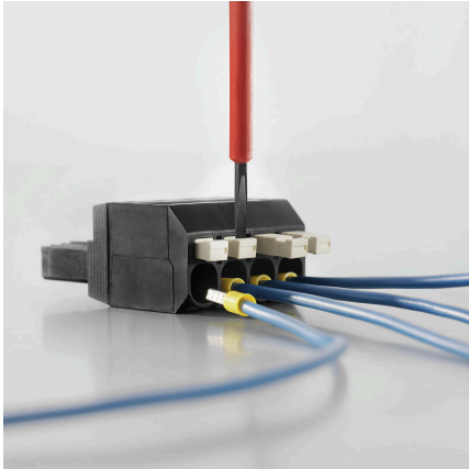
Secure connection of small conductors PUSH IN WIRE READY