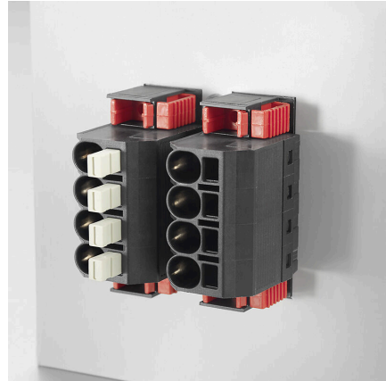
Installation without tools Outlet direction: 90° und 180°