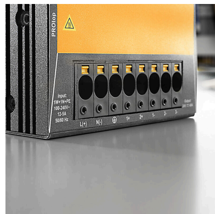
Power up to UL 600 V offset solder pins