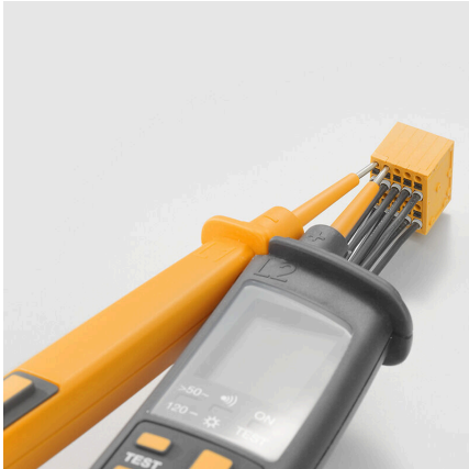
Maintenance through test tap