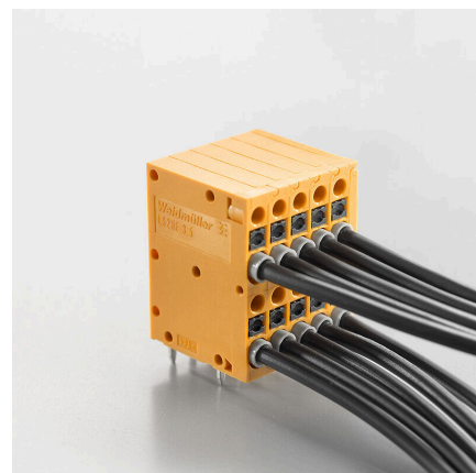
Compact design with 2 levels