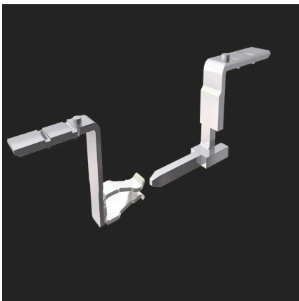
Uncompromising functionality High vibration resistance