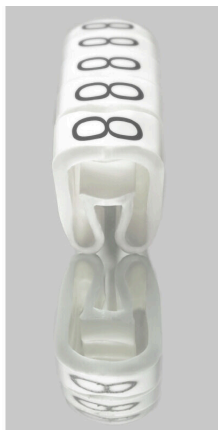
Similar to illustration