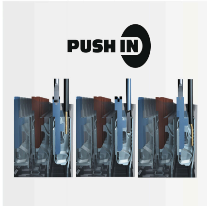
PUSH IN - fast and secure Invented by Weidmüller