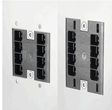
Space-saving power male header Through PUSH IN connection system