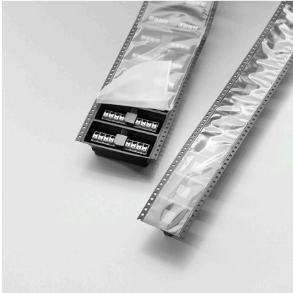
Packaged in tape-on-reel