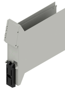
Base element including FE cut-out