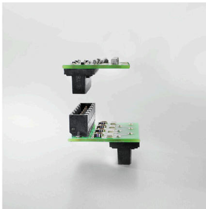
Connection made easySafe board-to-board connection