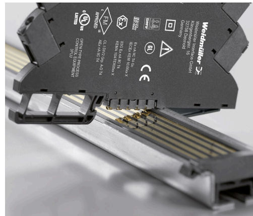
Additional power supply option via bus