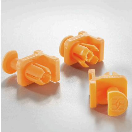
Lower assembly costs Secure in a matter of seconds