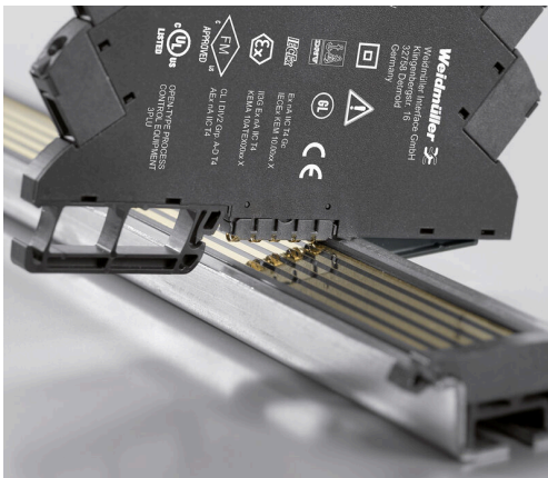
Additional power supply option via bus