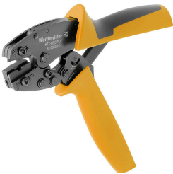
Crimping and stripping tools for processing the fibre-optic-cable contacts of polymer optical fibres (POF)