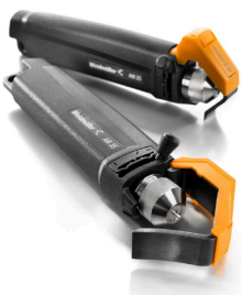
Sheathing stripper for PVC cables