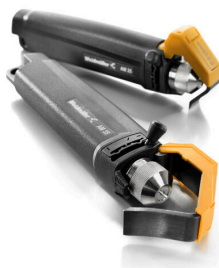
Sheathing stripper for PVC cables