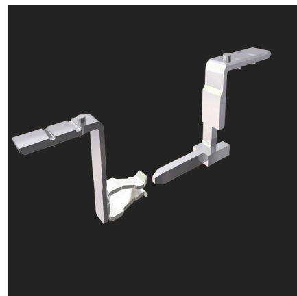
Uncompromising functionality High vibration resistance