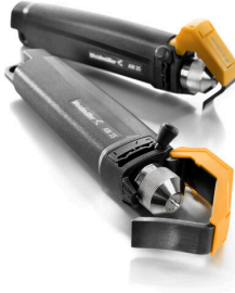
Sheathing stripper for PVC cables